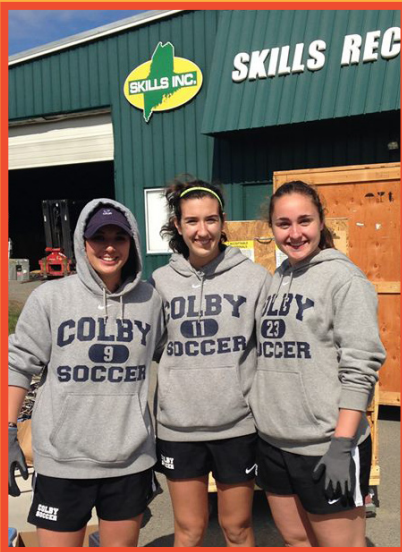
Colby Women's soccer team members—some of our 16 volunteers who put in over 46 hours of service at the Earth Day Recycling Event at eWaste Alternatives, April 22 & 23, 2016. (Event co-sponsored with Mid-Maine Chamber of Commerce.)

105 Kennedy Memorial Drive Waterville, ME 04901