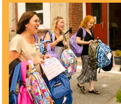
RSU 18 teachers rejoice in receiving filled backpacks donated through Stuff the Bus.

The goal was to fill 500 backpacks with the donated items, which would then be distributed to students throughout Kennebec and Somerset counties. Thanks to our generous community, the goal was surpassed, filling 550 backpacks!